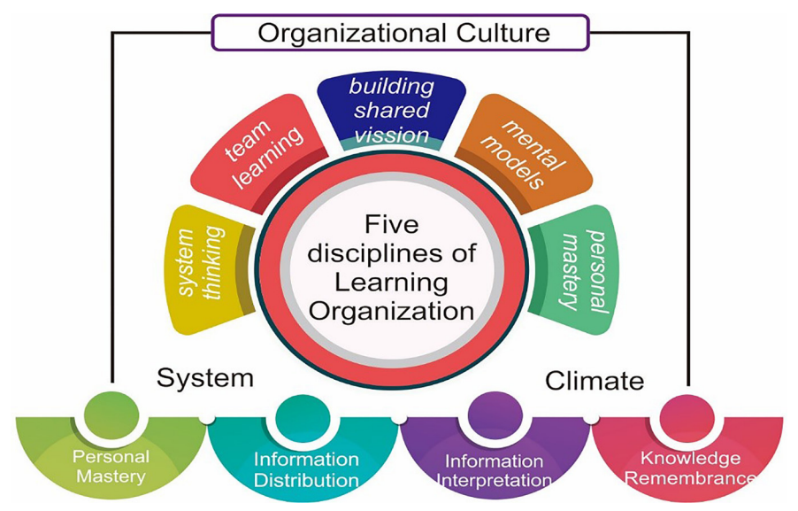
Figure 1: Learning Organization Development Model

Thus, organizational culture is not static but dynamic. The dynamics of the growth and development of organizational culture as shown in the following concept model: