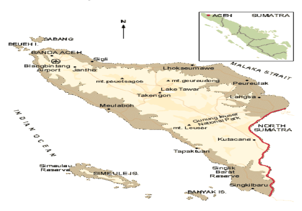
Figure 1: the map of Aceh

Aceh is one of Indonesian provinces where is situated in the tip of Sumatra island. There are approximately 4 million people living in the tensest endeavour of self-determination society in Indonesia. Aceh has 23 regencies namely Meulaboh, Blangpidie, Jantho, Calang, Tapaktuan, Aceh Tamiang, Takengon, Kutacane, East Aceh, North Aceh, Lhokseumawe, Bener Meriah, Gayo Lues, Siglie, Meureudu, Sinabang, Bireun, Nagan Raya, Banda Aceh, Lhokseumawe, Rekap, Sabang and Subussalam (Government: 2009).