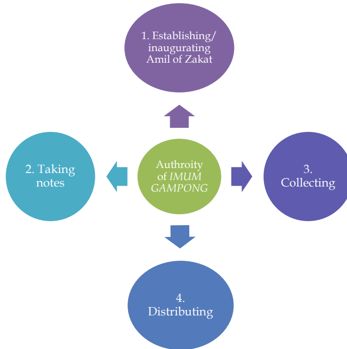
Figure 2. Amil of Zakat authority chart according to the Qanun of Aceh

From the chart above, in the management of zakat assets, the Imum Gampong authority is an extension of the government to select and inaugurate workers in handling and managing amil of zakat. Meanwhile, Imum Gampong is not directly involved in the zakat management process.