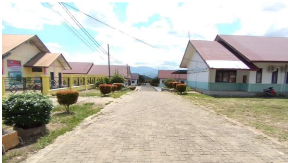
Figure 1. Main road in Dayah Perbatasan Darul Amin

The implementation of activities that do not burden the teacher unilaterally reflects the participatory leadership in terms of organization. When all the elements living in the Islamic boarding school have a calling to keep their environment clean, the value of justice appears in the Islamic boarding school.