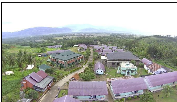
Figure 2. Aerial view of Adiwiyata boarding school site

Figure 2 exposes that the boarding school has a beautiful site layout, which is designed as an environmentally friendly and healthy Islamic Boarding School. As a form of increasing the boarding school's greening, the greening activities are coordinated by the gardening department. Some of the work outputs are creating the school parks, which are located at several strategic points. The boarding school community's involvement in maintaining and caring for the building will foster the importance of environmental management for the comfort of the school.