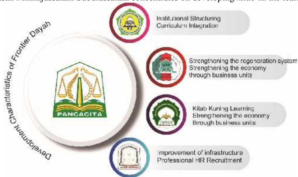
Figure 2: Comparative Characteristics of Frontier Dayah Organizational Development

Referring to the strategic planning that has been set, each pesantren has a different priority development program. The following is a comparative analysis of the dayah perbatasan . Dayah Perbatasan Darul Amin has made Islamic boarding schools' regeneration and economic strengthening a priority program. Dayah Perbatasan Manarul Islam Aceh Tamiang has made institutional restructuring a priority program. This is due to the lack of vision alignment between school principals in charge of formal education and pesantren leaders. Dayah Perbatasan Minhajussalam is at the forefront of kitab turats based education and has become a regional icon in all competitions at regional and national levels. Dayah Perbatasan Minhajussalam Subulussalam concentrates on developing kitab turats learning.